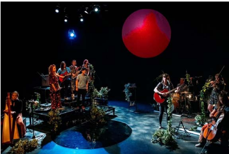
Lost in Music.

A grant of £5,000 was awarded to develop Lost in Music , a new music/theatre work aimed at a young adult audience. It explores the relationship of young people to music, and its importance to identity. It was produced by Magnetic North in partnership with North Edinburgh Arts (NEA) and had two distinct phases: