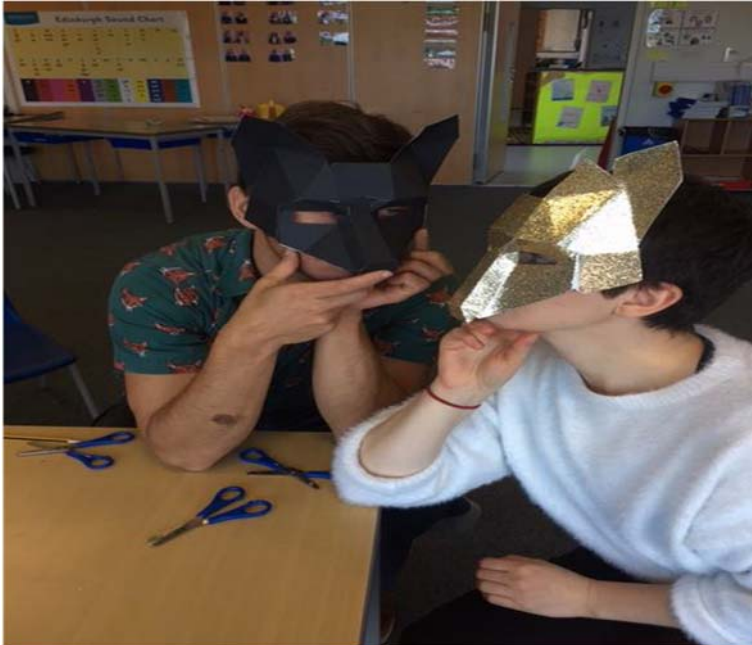
Back2School: Breakout ! at Niddrie Mill Primary School.

A grant of £5,850 was awarded to produce the 'Back2School' residency project, delivered in partnership with Niddrie Mill Primary School (Craigmillar), bringing live dance, theatre, music and art interventions into the school environment.