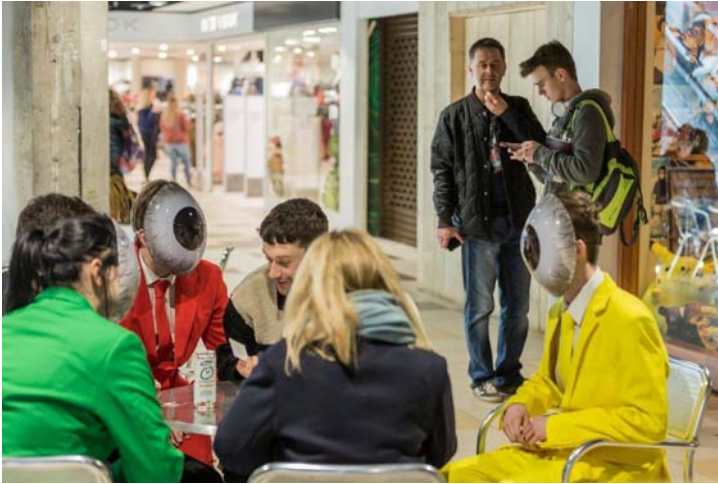
Shoplifter/Shapeshifter engagement activities Waverley Mall April 2018

Shoplifter<>Shapeshifter will also be performed at Imagine's family day on Saturday 25 May 2019 at the National Museum of Scotland before going on to the West End Festival in Glasgow. The Company tells us: " Shoplifter<>Shapeshifter is the project that just doesn't end! It keeps growing and evolving which is brilliant.....We've had a lot of fun exploring where the piece works and where it doesn't. It's been a lot of trial and error which has been a really good learning experience for our participants "