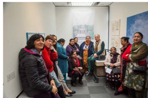
Women from Sikh Sanjog watching the film Bureaucracy of Angels by Broomberg and Chanarin inside Travelling Gallery