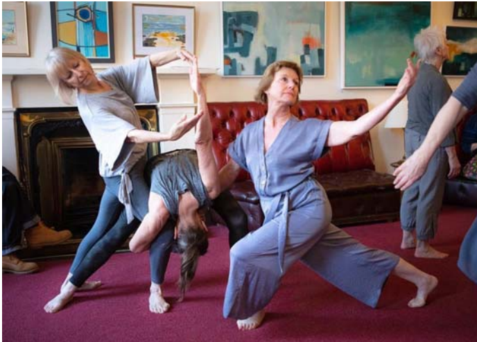
Glimpse at the Scottish Arts Club.

A grant of £5,000 was awarded to develop Glimpse – a site-specific, immersive, multi- artform and multi-generational performance in partnership with the Scottish Arts Club. Glimpse was curated by Dance Base’s artistic director to animate the Arts Club in a new and radical way. Choreographic creativity, spoken word and film was used to give insights into the past, present, and future of the building, with references to visual arts throughout with tableaux vivants from some of the great Renaissance masterpieces to text written by Edvard Munch and references to Warhol and Charles Atlas.