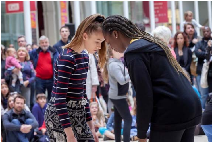
Group Hug by Tin Crate.

Partnerships were developed, including with Dance Base's PRIME over 60's dance company and Bun-sgoil Taobh na Pàirce and will lead to future joint working.