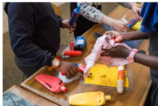
Children enjoying our printmaking workshops at WHALE Arts, Wester Hailes, Edinburgh